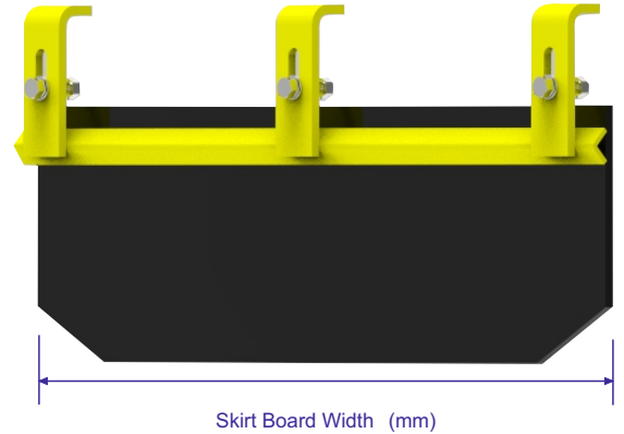
Optic Image after installation of BMD BHARAT REAR SKIRT SEAL SYSTEM

F: Fire Retardant Rubber sustain upto 180°C intermediate temp